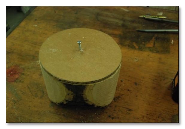
Figure 16: Locating the bottom is easy using the method shown. Most natural edge bowls start mounted between centers, and knowing where the center of both ends is located saves time and is more accurate.

Remove the template from the blank and position it on the bottom. Use the screw to mark the approximate center on this side. (See Figure 16.)