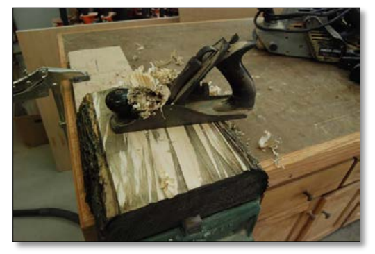
Photo 5 shows what just a few strokes with the hand plane will do to the surface of the blank. The plane will cut the wet wood fairly quickly and will make short work of smoothing out a blank that wasn't too rough.

The power plane is the ideal tool to use for surfacing the wet blank. It is quick and removes the wood easily. I think I paid around $40 for the tool and it is worth every penny!