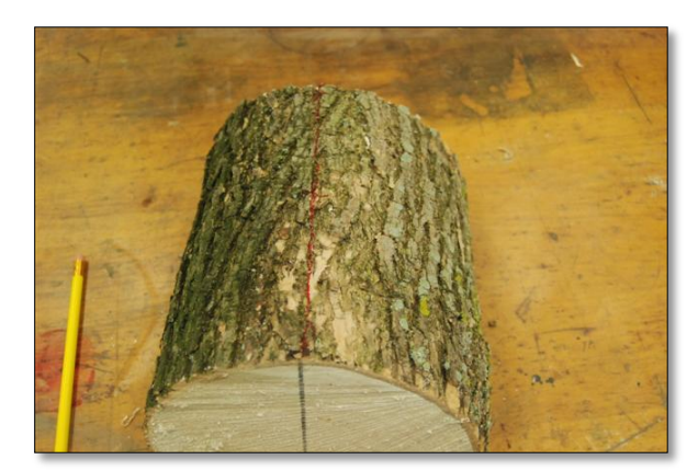
Figure 13: Connect the ends of the plumb line to locate the centerline of the blank as shown. Mark the approximate center of the line so you will know where the circle will be cut.

Next, draw a mark on top of the bark to connect the two plumb lines. (See Figure 13.) This will locate the centerline so you can cut the blank round. This will start the balancing process for the natural edge bowl and make it a bit easier. I cut the perpendicular line on my band saw since the blank was so small, however you could also cut it with the chainsaw.