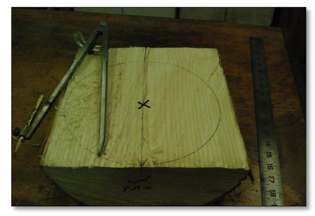
Figure 10: Draw the circle for the blank as shown. Be sure to note where the center of the blank is located by drawing a large "X" with a marker. It is often hard to find the center point hidden under the Anchorseal.

All that is left to do is to draw a circle of the correct diameter using the line you just drew to locate the center point for the compass. We all want to get the absolute biggest blank we can, but look carefully to eliminate any defects that might be present. (See Figure 10.)