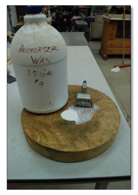
Photo 4: Anchorseal, although quite expensive, will help to prevent checking.

Once I get the slabs home, I draw circles on them with a large compass and cut them into sections with my chainsaw. Then I bring them into the shop and cut them into rounds with my band saw as shown in Photo 3. From here you have several choices, some better than the others.