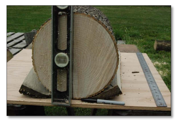
Figure 3: The initial plumb line drawn in will establish a reference line on both sides of the log section and will allow you to lay out two parallel blanks on either side of the pith.

I span the sawhorses with a piece of scrap plywood or some other material. The log section is held in place by shims to prevent it from rolling around during the cut. Position the log so that the pith is somewhat centered to produce the greatest yield from the log. I use a level to draw a plumb line through the pith. Do the same on the opposite end. (See Figure 3.)