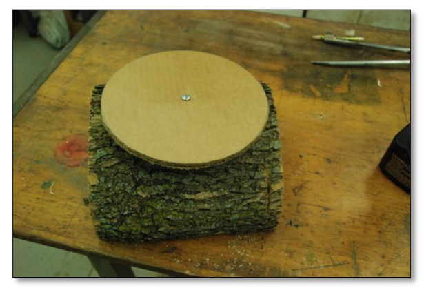
Figure 14: The circle screwed to the blank is easy to follow with the band saw. This method is much easier and more accurate than trying to draw a circle with a compass.

Rather than try to draw a circle on the blank with a compass, cut a circle out of cardboard or 1/4" plywood. Drill a hole in the center and secure it to the center of the blank with either a small nail or a screw. I prefer to use a screw. (See Figure 14.)