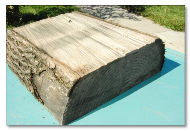
photo2 is an ash blank that is rough, but not so badly cut that it would be unusable.

You will note that there are some lines and ridges that might cause problems and the task here is to eliminate them to produce a flat surface. Photo 2 has a rougher than desired surface that could cause problems when cutting the blank.