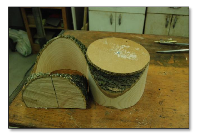
Figure 15 shows the final result after cutting out the circle on the band saw. I have a number of circles of different diameters that I use for natural edge bowls. The templates will last for quite a while if you are careful when cutting and just rub the outside of the pattern with the blade.

It takes a bit of practice to get used to following the cardboard circle, but it does a much better job. You can see in Figure 15 that the circle looks fairly accurate.