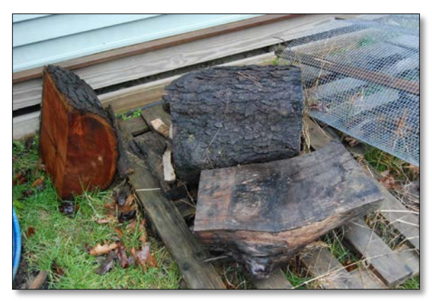
Photo 1: Blanks are best kept as large as possible unless used quickly.

Once you have become fully addicted to woodturning, the problem of where to get your wood becomes paramount. You will soon discover that once folks learn of your new-found hobby and that you are actively seeking a source of wood, it will start to appear in your driveway, often unannounced. So what do you do with it once you have it to prevent it from turning into just another pile of firewood?