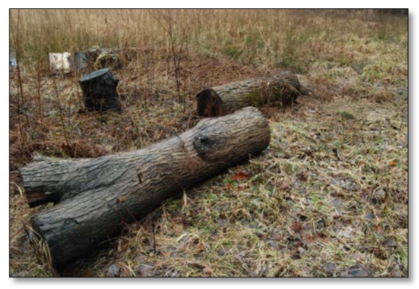
Photo 2: Long is best. You can cut off whatever you need for the day's activity without losing wood to checking.

That way, you can cut off any bad wood and you will be able to turn larger pieces. Photo 2 shows how I prefer to keep wood stored until I am ready to use it. A better method would be to store the logs up off the ground on pallets, if at all possible.