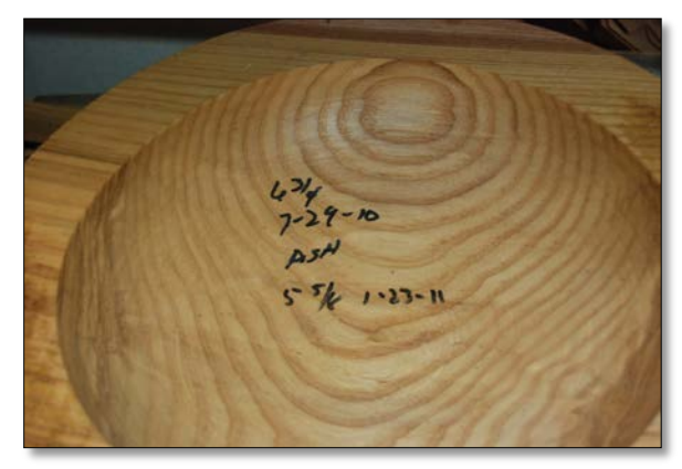
Photo 8: Periodically weighing the blanks will tell you when they are ready to use.