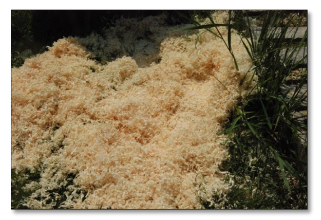
Figure 7: The ripping cut produces long, wispy shavings shown. Be careful that they don't clog the discharge chute of your saw.

Notice that I have followed the line the best I could in Figure 8. Also note that I have not cut all the way through the log section. Leaving the log intact for as long as possible allows you to control the cut better and provides more stability while making the cut.