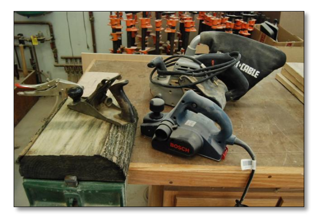
Photo 4 shows the tools that could be used to flatten the blank enough to cut successfully with the bandsaw.

There are a number of tools that you could use to flatten the blank and these are shown in Photo 4.