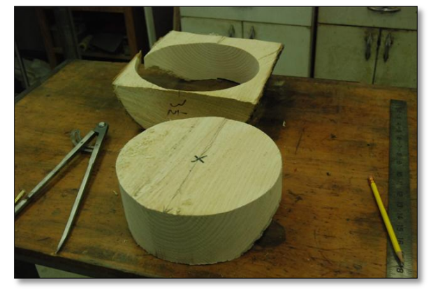
Figure 11: The finished blank is shown. As noted, a number of options are available for the next step.

Figure 11 shows the finished blank after the circle is cut on the band saw. All that is left to do is either coat the blank with Anchorseal or put it in a plastic bag (as noted in Part 1), rough turn the blank and coat it with Anchorseal or finish turn the bowl.