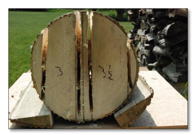
Figure 8: Don't cut all the way through the log when making the initial cuts. The log will be more stable and safer done this way. Once all the cuts are made, you can go back and finish the cuts starting with the two outside cuts.