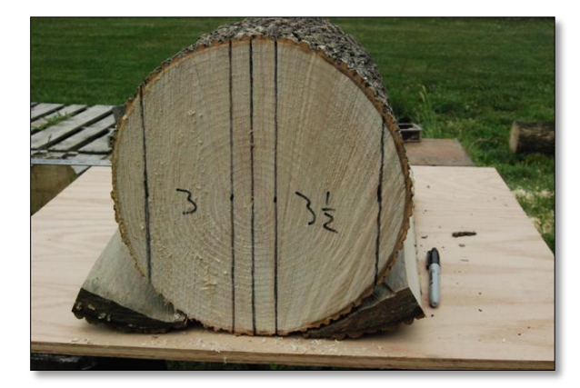
Figure 4: You do not want the pith to be present in either blank so the first lines drawn are to eliminate it. You will note that I drew two lines adjacent to the initial line, 1-1/2" apart I then laid out the two blanks with the level, making sure that the lines were plumb. The other end is the mirror image of this end.

I projected the lines from either end up to the top with a marker and then connected them with the handsaw.