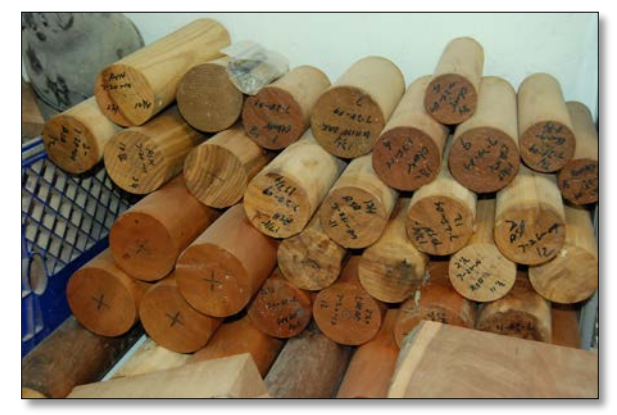
Photo 9: This method will work for spindle turning blanks as well.