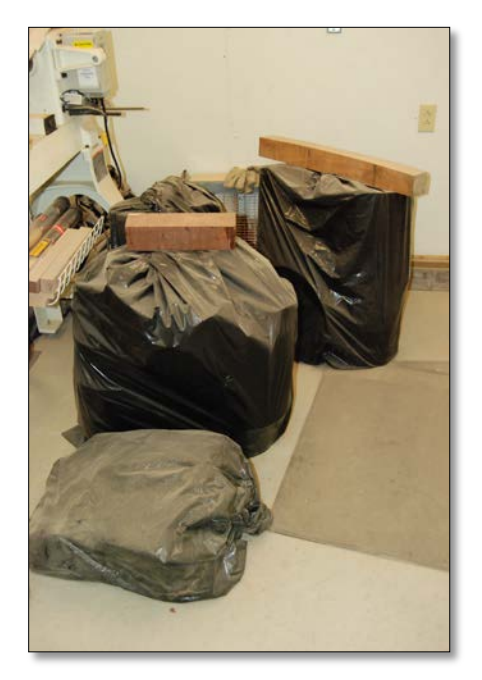
Photo 5: Storing the blanks in a large plastic bag is one way to prevent checking.

One method is to coat the blank completely with something like Anchorseal, a water-based product that creates a wax barrier that helps to prevent end-checking. It can be brushed on, dipped, or sprayed over the entire blank, although most folks just do the endgrain. It is quite costly, but if you buy in bulk as our club does, it is quite affordable. (See Photo 4.) The blanks can then be stored until ready to use.