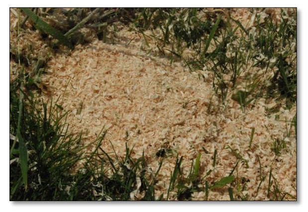
Figure 6: The shavings shown are the kind normally produced when crosscutting with the chainsaw. They are easily discharged from the saw and usually don't present a problem.

The chainsaw can be a very dangerous piece of equipment. Please be sure to wear the proper protective gear and get some instruction if you are not sure of correct procedures (see Figure 6).