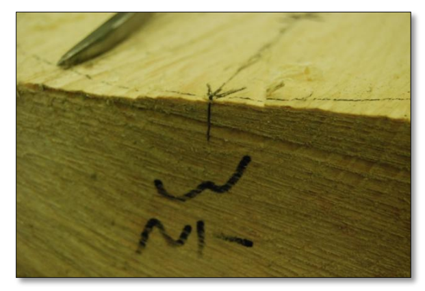
Figure 9: Locate the approximate pith center on both ends of the blank and draw a line through it as shown. This will help you to center the blank and the grain pattern in the resulting bowl will look more balanced.

I have found that the finished bowls look more balanced if you take the time to lay out the round blank so it is centered on the centerline of the blank. By this, I mean a line that travels through the pith even though it was removed. The first thing I do is to locate the approximate center of the annular rings on both ends of the blank and mark it with a line. (See Figure 9.)