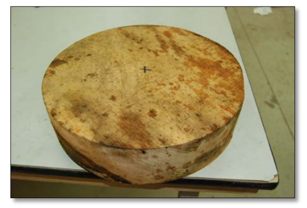
Photo 3: Be sure to mark the center once you cut the wood into rounds.

Once I get the slabs home, I draw circles on them with a large compass and cut them into sections with my chainsaw. Then I bring them into the shop and cut them into rounds with my band saw as shown in Photo 3. From here you have several choices, some better than the others.