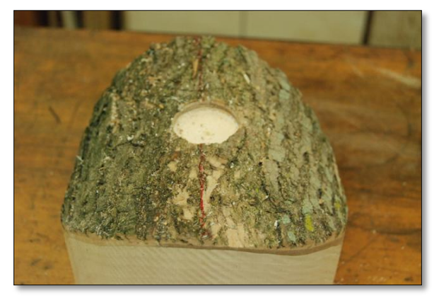
Figure 17: Drilling a large hole through the bark and inner layer provides a stable rest for the spur center.

The last thing to do is to use a large Forstner or multi-spur bit to drill a hole through the bark and into solid wood. The bark and the inner layer are not stable and locating the spur center in solid wood provides a more stable mount and allows you to manipulate the blank to balance it. (See Figure 17.)