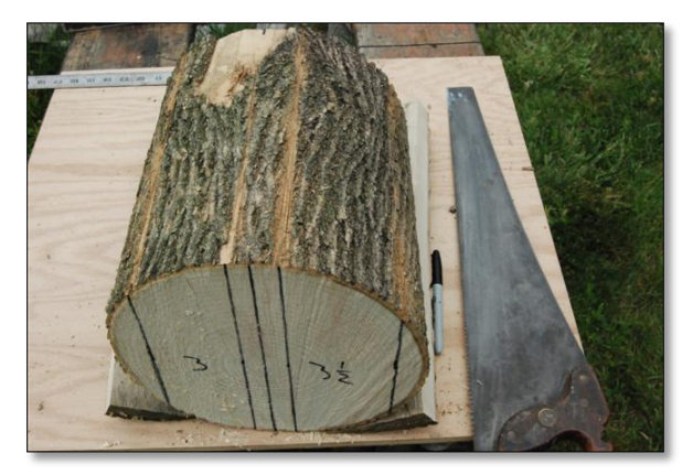
Figure 5: The lines on the top of the log will show you where to cut with the chainsaw. They are much easier to see when cutting than if I had drawn them with a marker. They don't have to be cut very deep, just deep enough to score the bark.