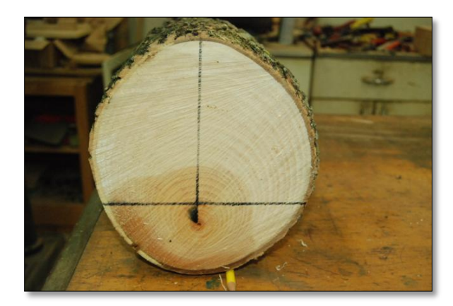
Figure 12: Draw a plumb line through the pith and then draw a perpendicular line that intersects it as shown. This is done on both ends and will allow you to locate a centerline that corresponds with the centerline of the blank.

The layout starts the same as with a regular bowl blank; a plumb line drawn through the pith. Once that is done, a perpendicular line should be drawn to eliminate the pith center and to create a flat bottom for the blank. (See Figure 12.)