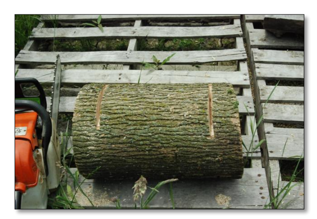
Figure 2 shows the log laid out, ready to be cut to length. I cut the section out in the middle of the log in order to eliminate any cracking that was present on the ends. You will have to keep reducing the length until all the cracks are gone, even if it means working with a smaller blank. There is no point in trying to turn cracked wood! Try to get as square a cut as possible when cutting to length.

I didn't have any logs that were as long as I would have liked for this article, but I did have some fairly fresh cut ash that I got for firewood. Several of the pieces were long enough for demonstration purposes. I measured the diameter of the log and laid out the cuts from the center of the log. The log was 10-1/2" in diameter, so I laid out an 11" section as shown in Figure 2.